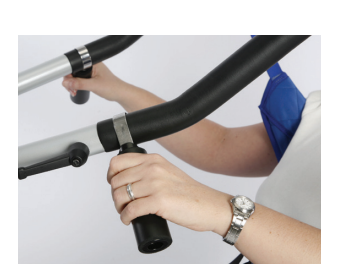
Add on handles.