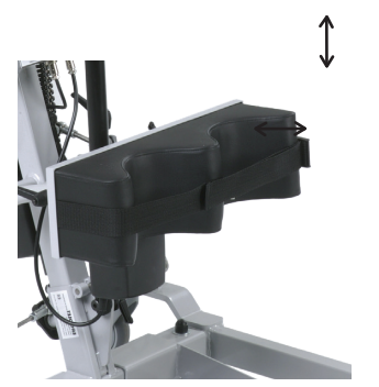
Multi adjustable knee support for increased comfort.