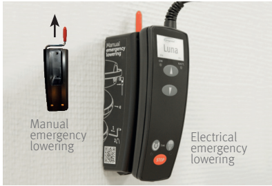
Manual emergency lowering functions: powered on hand control and manual on Luna motor.