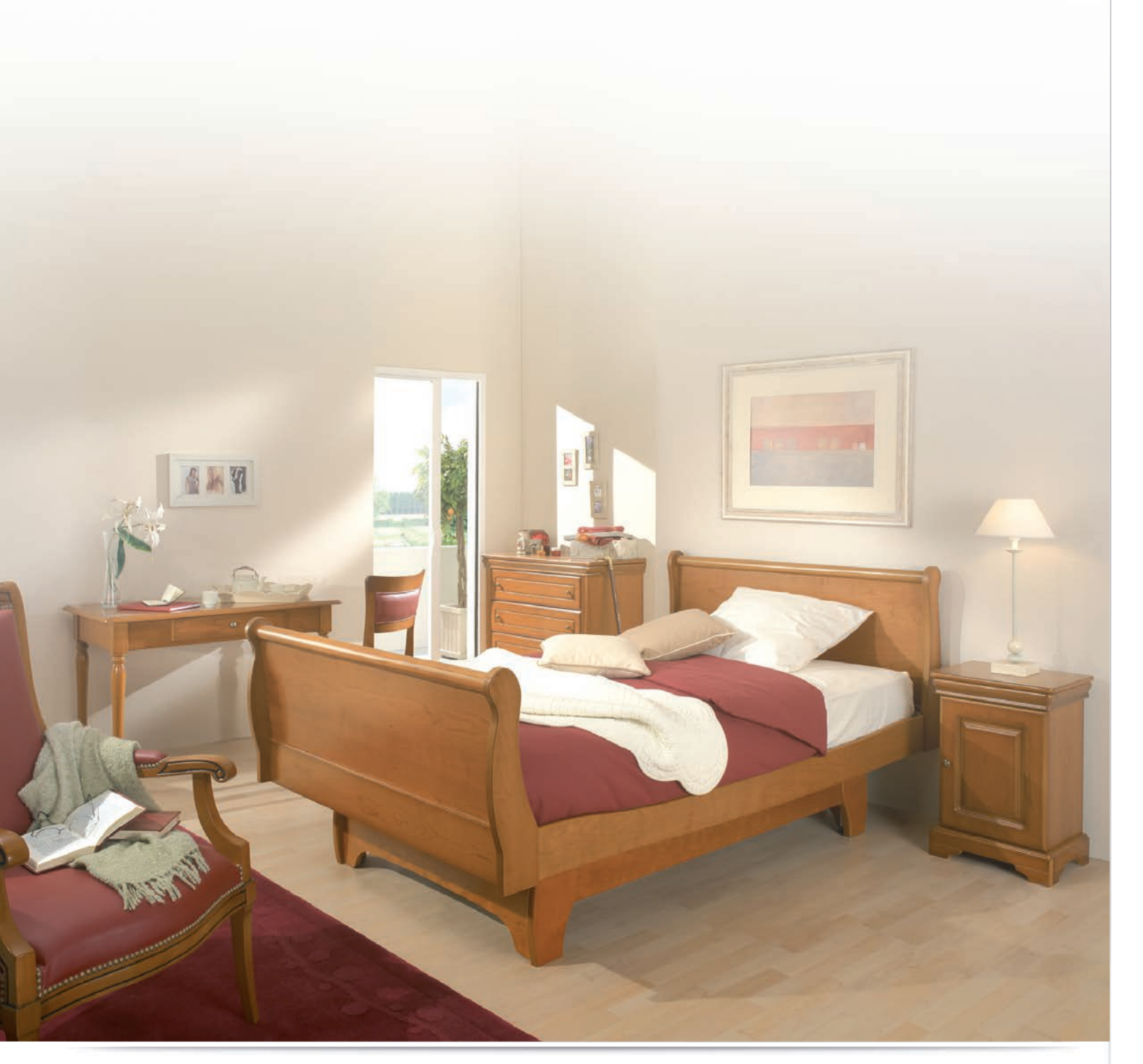
Ambiance Louis Philippe All in Copper Plum Legs, molding and banding in solid beech and re-veneered beech The chair and armchair are no longer available